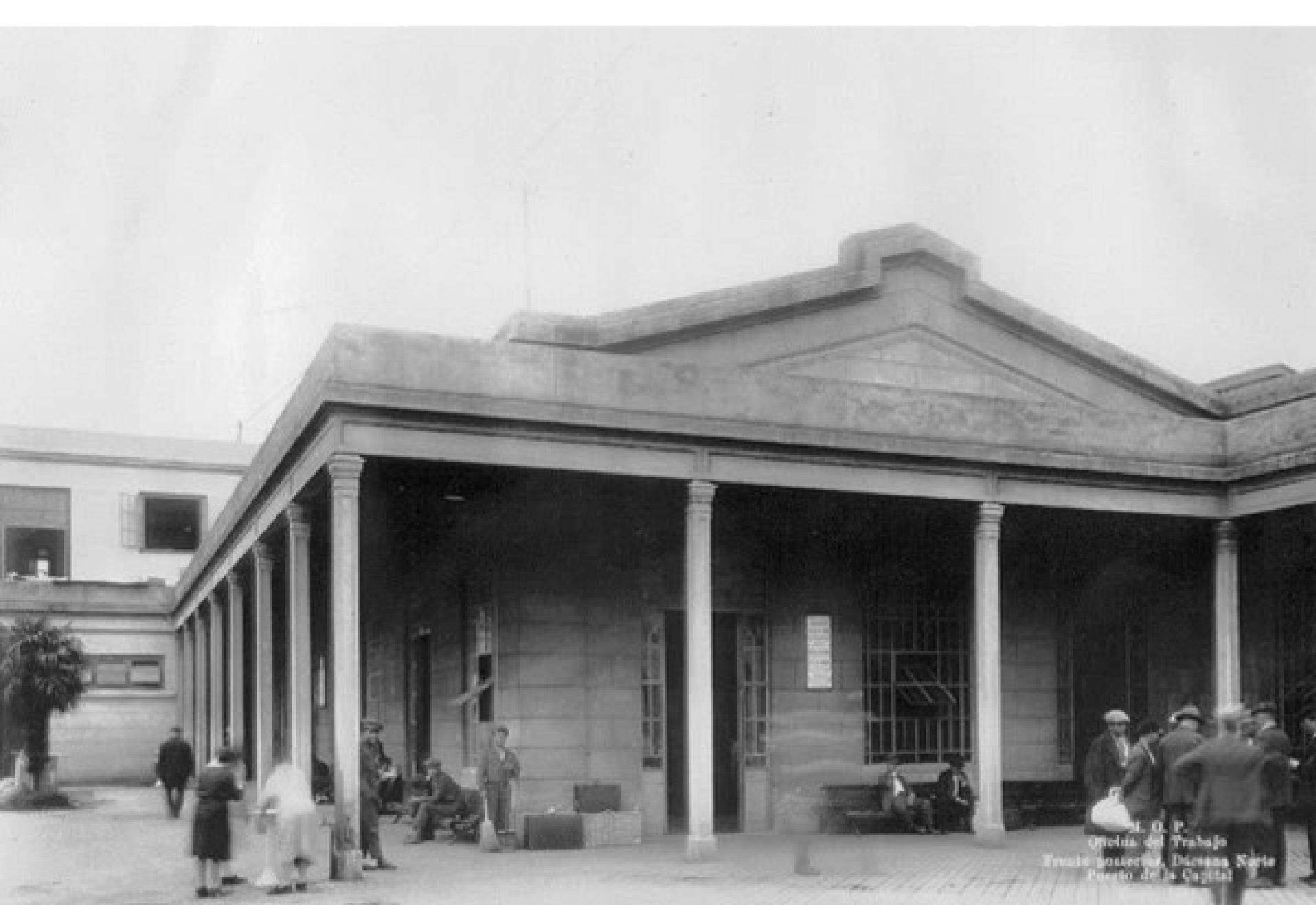
L. O. P. Ministerio del Trabajo Frente posterior, Dirección Norte Puerto de la Capital